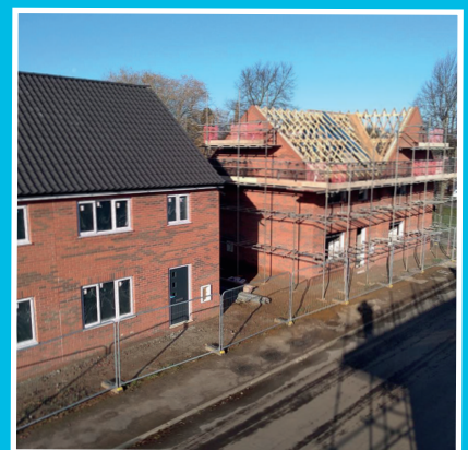
The progress at our homes in Walsoken.