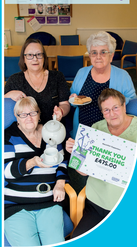
Last year's coffee morning

The amazing people living at Windsor Park, one of our sheltered schemes in King's Lynn, have raised thousands of pounds at their Macmillan Coffee Mornings over the years.