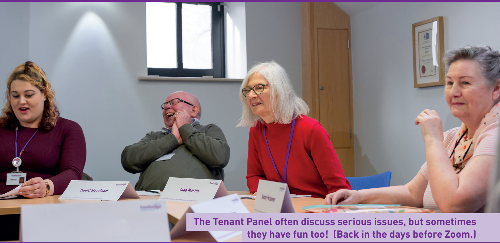
The Tenant Panel often discuss serious issues, but sometimes they have fun too! (Back in the days before Zoom.)